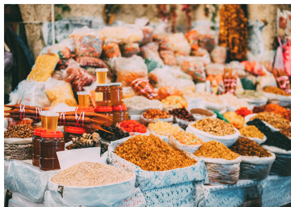
Dried fruits, Tbilisi Market

TUE 13: TELAVI > SIGHNAGHI > TBILISI B L D Visit the local farmers market in Telavi before heading to the fortified town of Sighnaghi, famous for its wine and carpet making culture. Enjoy breathtaking views of the Kizikhi area and the unusual charm of Sighnaghi Royal Town. Walk the narrow streets with buildings characterised by their intricately carved wooden balconies. Lunch is a culinary masterclass and wine tasting before continuing to Tbilisi.