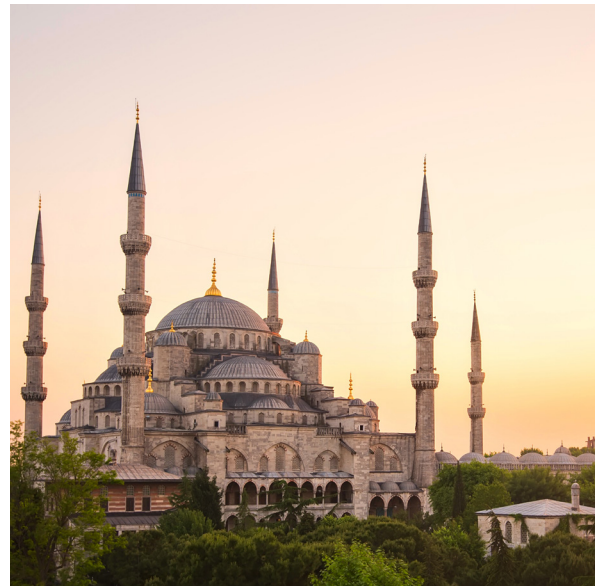
The Blue Mosque and the Hagia Sophia, Istanbul

See how this modern centre offers free education to rural communities, and stay at the Concept Hotel, operated as a social enterprise.