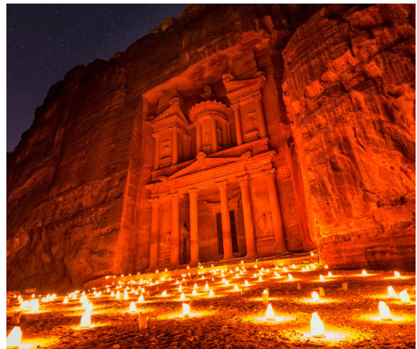
The Treasury, Petra

Overlooking Luxor temple, this winter retreat for the Egyptian royal family is the epitome of faded, luxurious glamour. Be sure to explore the extensive gardens, sip a cocktail as you watch life alongside the Nile, or take afternoon tea in one of the majestic reception rooms.