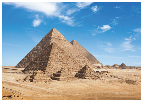
Pyramids of Giza

A full day to explore the Pyramids and Sphinx at Giza followed by the ancient capital of Memphis and the step pyramid and tombs at Sakkara.