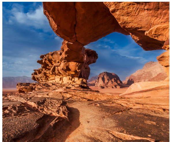
A rock arch in Wadi Rum, Jordan