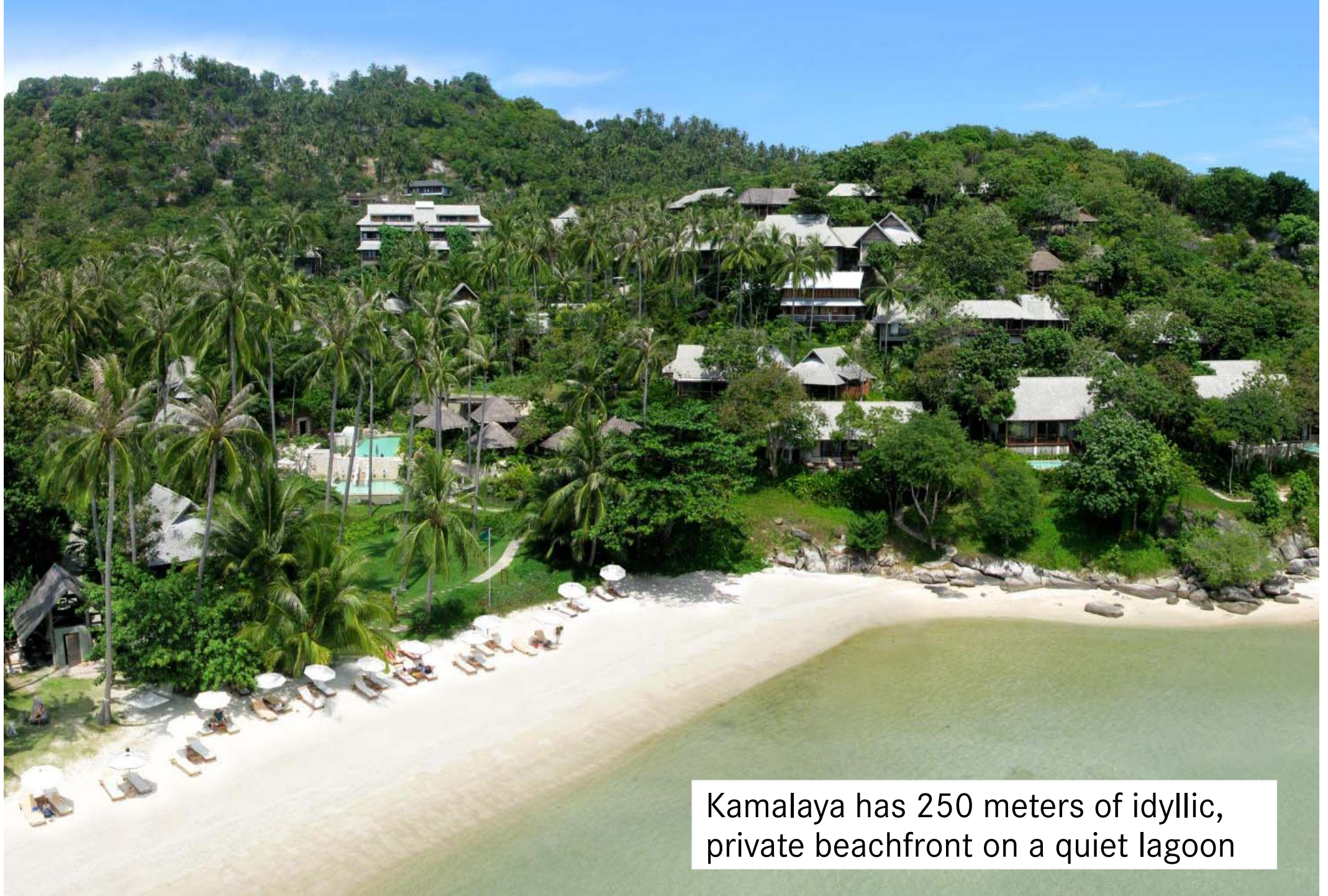
Kamalaya has 250 meters of idyllic, private beachfront on a quiet lagoon