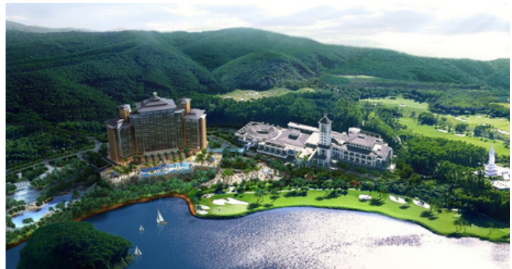
Donnguan Resort Mission Hills

Prices based on Twin Share and minimum of 4 people. Extra Cost for single supplement. Non Golf rate available. All prices subject to currency fluctuation and availability. NZD100 deposit upon booking.