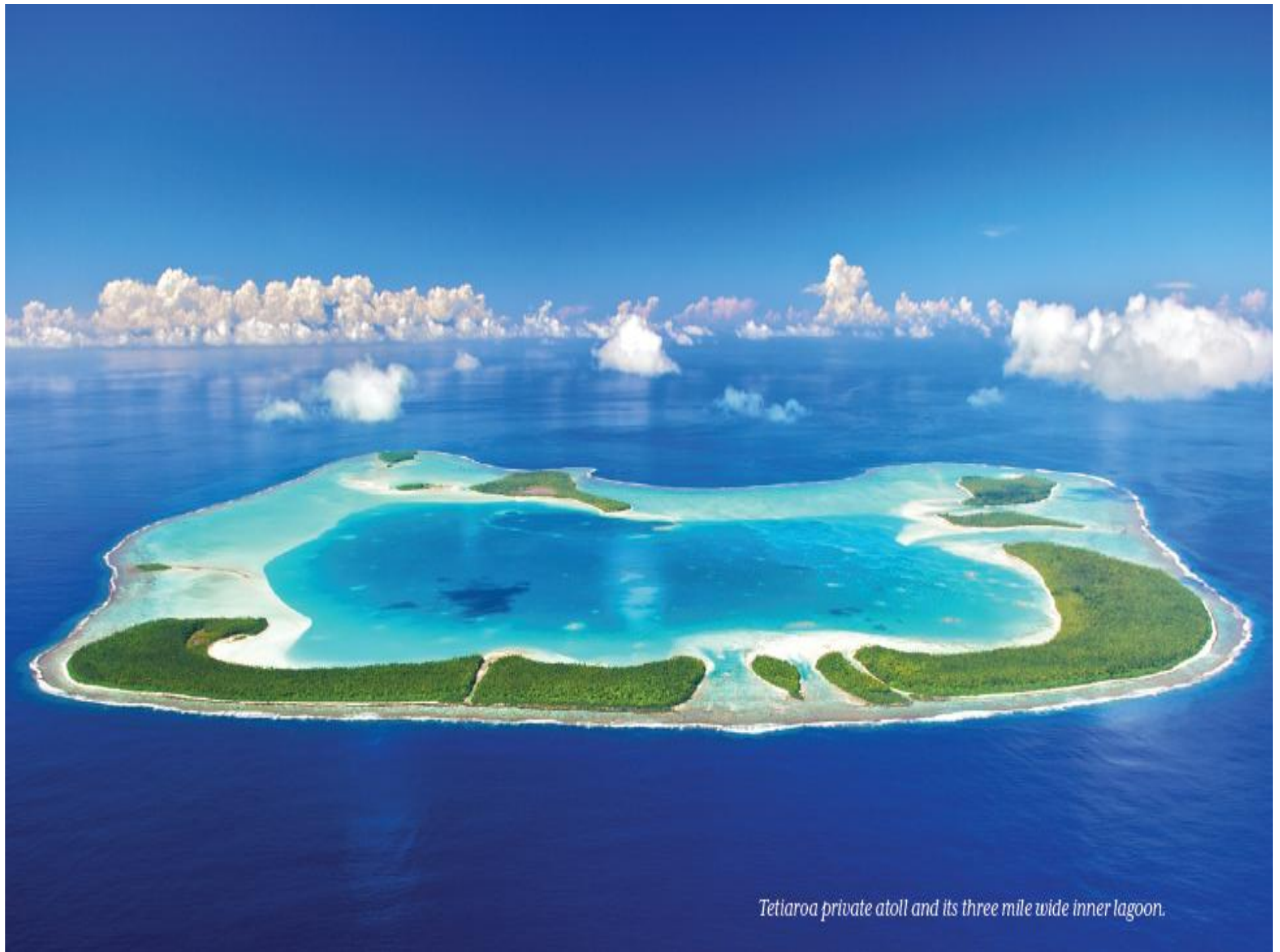
Tetiaroa private atoll and its three mile wide inner lagoon.