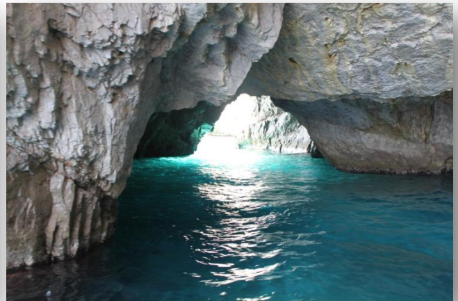
Caves on Capri