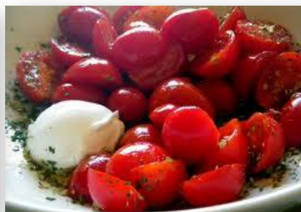
Bufala and Cherry Tomatoes