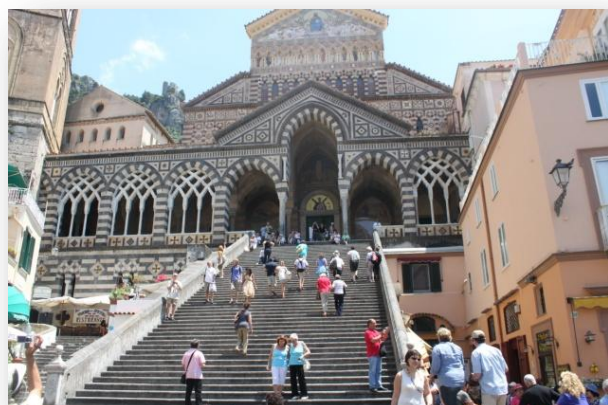
Duomo de Sant' Andrea in Amalfi

Allow yourself a day to explore the town of Amalfi and take in the imposing staircase that leads from the square up to the magnificent Duomo di Sant'Andrea. Then head on the road leading out of Amalfi for about 200 metre to La Luna Hotel and restaurant. www.lunahotel.it The open air restaurant has 180 degree views of the Med and great food. For a special occasion make a reservation at Eolo www.eoloamalfi.it Request a table on the terrace.