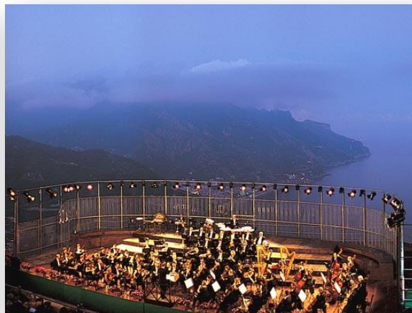
Concert at Villa Rufulo