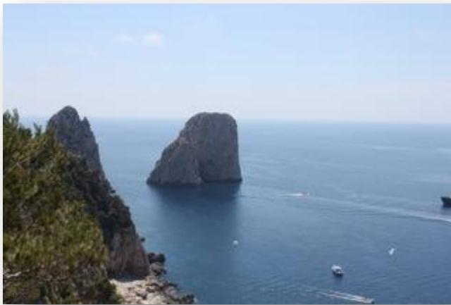
Coastline of Capri

“To visit Capri for the day take one of the private boat excursions rather than the regular ferry. The boats are comfortable and take approximately 20 people. You will have time to explore Capri on your own and circumnavigate the island in the afternoon viewing the unusual caves, including the Blue Grotto.”