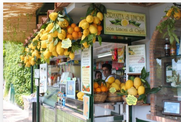
Lemons in abundance