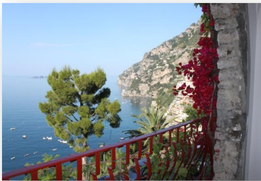
View from Hotel Eden Roc

Another great option also highly recommended by a client is the Hotel Eden Roc www.edenrocpositano.com This 4 star hotel in Positano overlooks the sea, and is situated a short walk from the beaches, restaurants and the centre of Positano. This family run business excels with its service. A roof top pool and lounge area serve excellent food as an alternative to the beach.