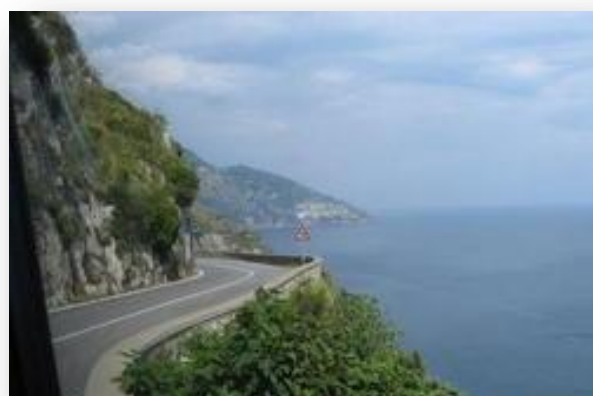
Amalfi Coast Road

From Rome, catch a train to Naples. Local buses run frequently around the coast although the preferred, safer, quicker and more relaxing option is to be met at the train station by a driver and transferred in your own private limousine. With plenty to see, the 90 minute trip is a great entrée to the region. Mt Vesuvius, famous for the violent and deadly eruption in 79 AD smothering the village of Pompeii, looks dormant and peaceful behind the picturesque and perfectly curved Bay of Naples. Breathtaking views of the Amalfi Coast come into view after climbing the mountain separating Sorrento from the coast. As you wind your way along the narrow and treacherous road to your destination distract yourself with the outstanding beauty of the coast as the locals dodge bullets with the oncoming traffic and overtaking manoeuvre.