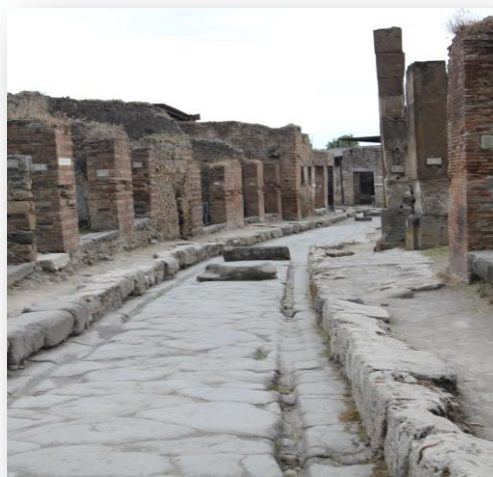
Pompeii Bakers Street